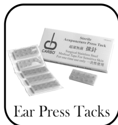
Ear Press Tacks