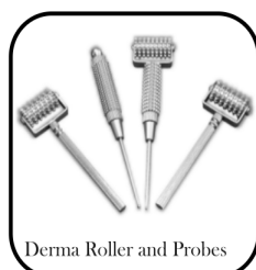
Derma Roller and Probes