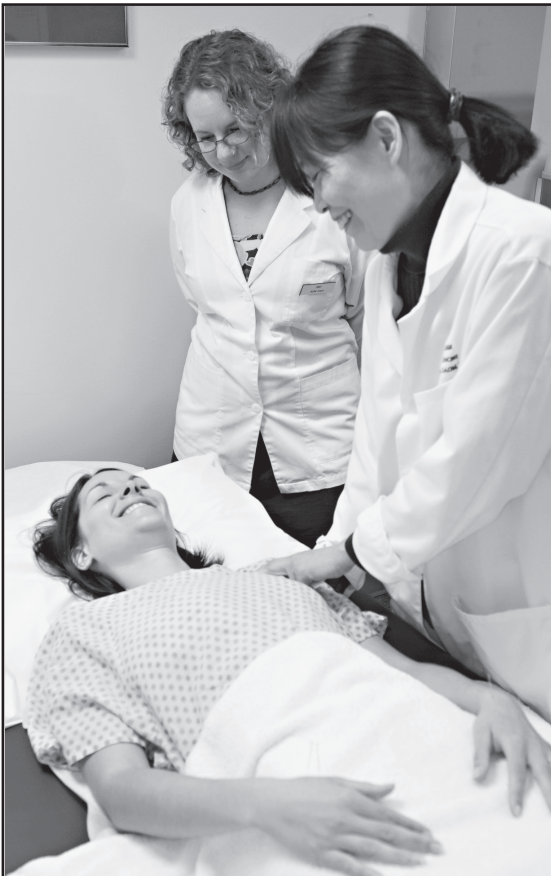
Oregon College of Oriental Medicine has more than 27 years of experience teaching, researching and guiding health and wellness. Visit our Portland, Oregon campus today.