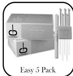
Easy 5 Pack