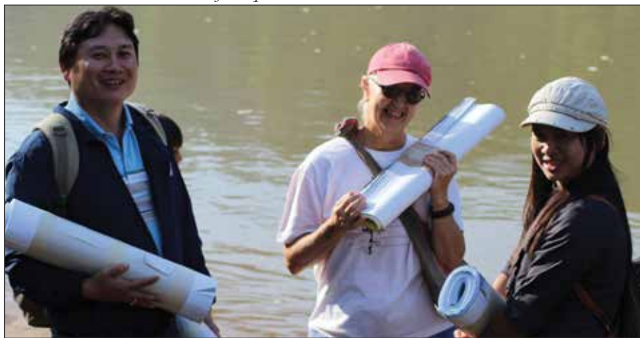
DARE Network continued from p. 5