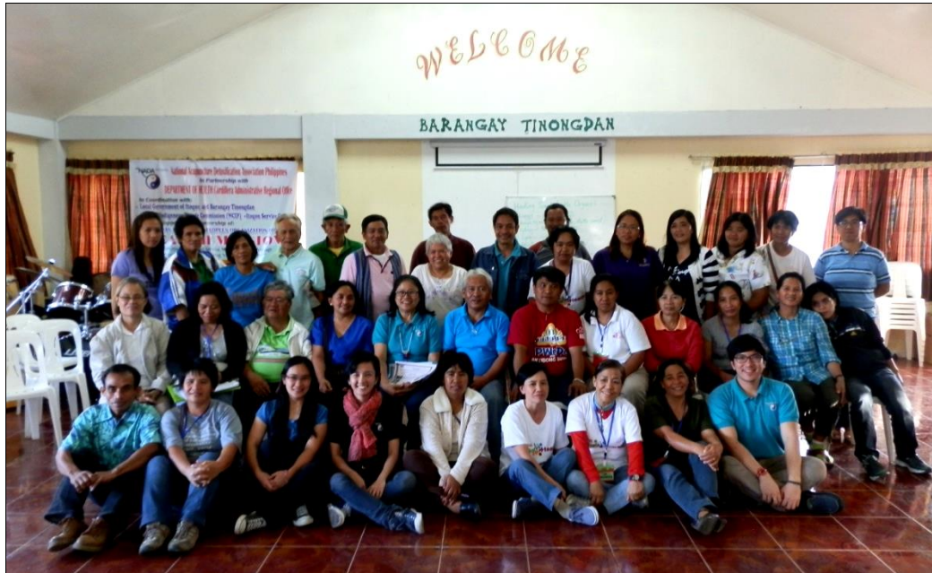
The NADA team with the Barangay officials of Tinongdan.

After the clinic hours on the third day, the NADA team and the Tinongdan Barangay officials held an assessment of the activity. The officials reported that the reception of the treatment was generally positive, with many of the people reporting an increase in strength and appetite. The officials have also expressed interest in furthering the treatment and they have also expressed hope that in the future, some people in the barangay will be trained as ADSes as well.