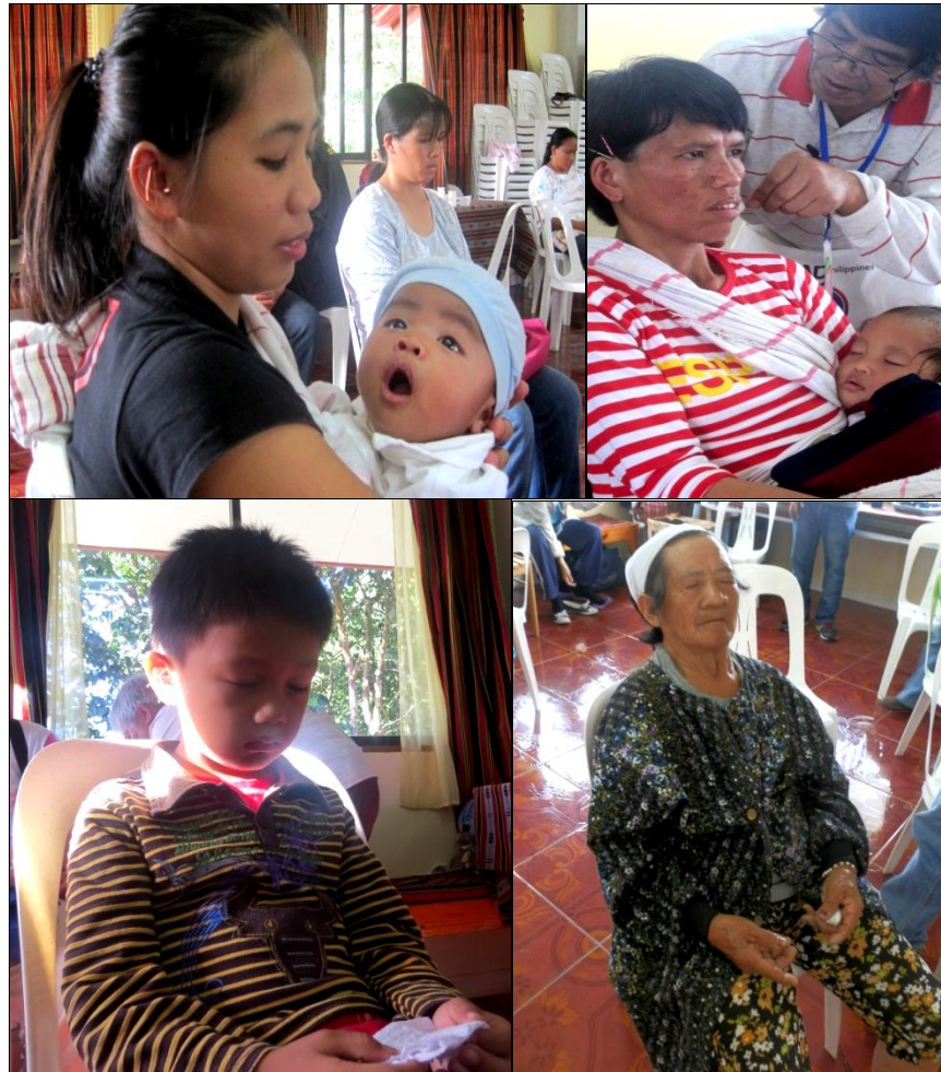
The wide range of the demographic who received ear acupuncture treatment in the three-day community clinic included mothers who brought their babies wrapped in woven blanket, children with their parents, and the elderly.

modes of transportation in the area only travel at this time. On the first day, almost 100 patients were treated in the morning alone. These included the elderly, mothers carrying their babies in a woven blanket, children, teenagers and middle-aged patients. Some of them have walked for hours from their homes at the foot of the mountain to get to the Barangay Hall for the acupuncture treatment. To accommodate these people who traveled on foot, the clinic hours were extended to five in the afternoon.