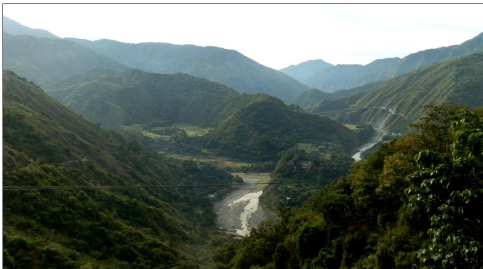
Picturesque view of Tinongdan from the Barangay Hall. Many of the inhabitants live at the foot of the mountains, in the fields.

Tinongdan is one of the barangays in the Municipality of Itogon, Benguet. It is the second biggest barangay with land area of 12,720.37 hectares, with generally mountainous slopes ranging from 30 degrees and above. Mount Ugo is one of the hiking areas every summer.