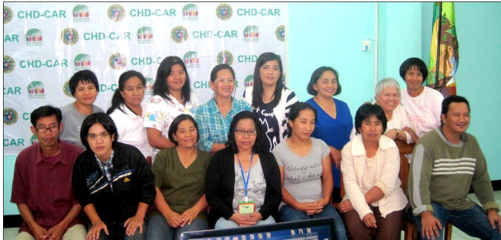
The fifteen participants of the NADA training in the Cordillera.

Three participants came all the way from the interior town of Kapangan, Benguet and two represented the National Commission for Indigenous Peoples (NCIP) in the Cordillera.