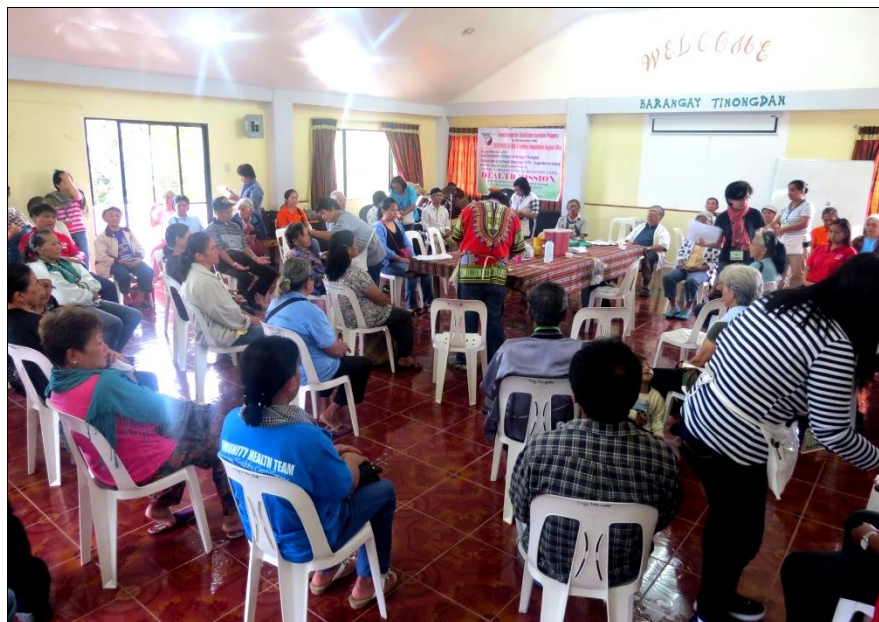
The Barangay Hall was converted into a clinic for three days.

Free ear acupuncture treatment was given at the Barangay Hall on November 27, 28, 29, 2014.