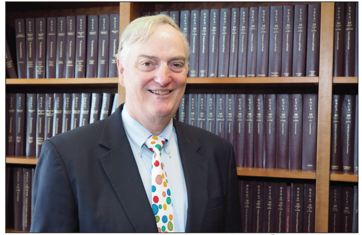
Judge Charles R. Pyle

This memo provides a lot to chew on. The point is not to find fault with past practices, but to focus on providing more treatment options going forward. It is easy to feel defeated before you get started when facing this problem.