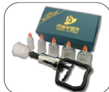
Premium Cupping Sets

118 BAYWOOD AVE. LONGWOOD, FL 32750 LOCAL TEL: (407) 830-0588 TOLL FREE TEL: 1-877-248-4539 FAX: (407) 830-1588 EMAIL: SALES@ACPMEDICAL.COM