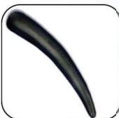
Gua Sha Tools and Sets