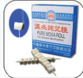
Full Line of Moxas