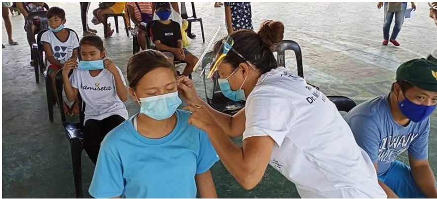
Children volunteered to have treatments too