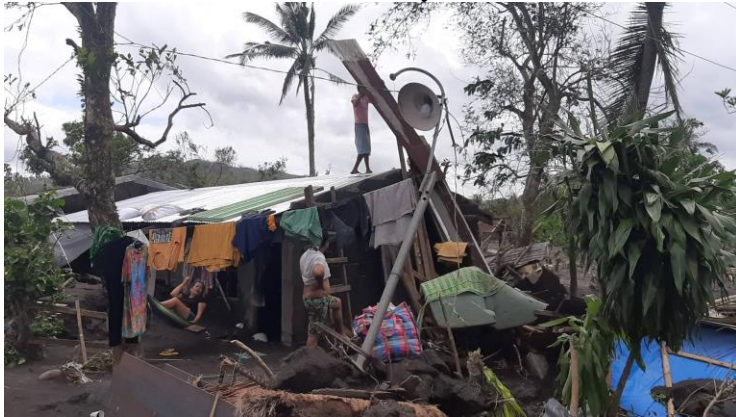
San Francisco, Guinobatan Albay – where mud flow destroyed houses, crops and farm animals.